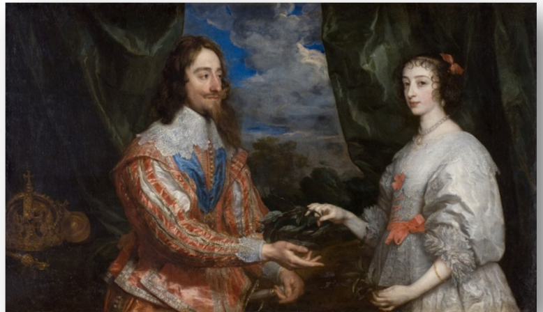
Charles I & Henrietta Maria, by Sir Anthony van Dyke

As March 25 was Maryland Day .... did you know Maryland was named in her honor of Queen Henrietta Maria, by her husband, Charles I. George Calvert, 1st Baron Baltimore. He submitted a draft charter for the colony with the name left blank, suggesting that Charles bestow a name in his own honor. Charles, having already honored himself and several family members in other colonial names, decided to honor his wife Henrietta Maria. The specific name given in the charter was "Terra Mariae, anglicize , Maryland".